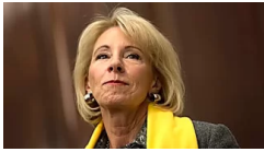
DeVos rips Oklahoma teachers over strike:...