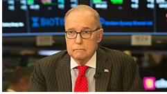
Kudlow confronted over attacks on Obama...