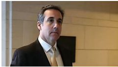
Trump allies fear feds seized lawyer's...

The USPS does give Amazon a shipping discount because of the volume of packages it ships. However, fact-checkers have disputed Trump's argument that Amazon is hurting the Postal Service, saying that the USPS' lack of profitability goes beyond its relationship with Amazon.