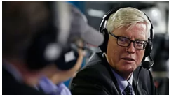
Ex-Bush ethics lawyer confronts Hugh Hewitt...